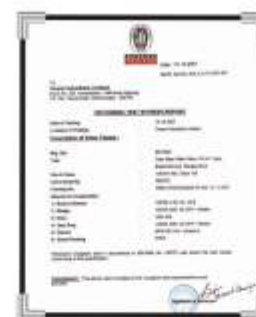
Cryogenic Test Certificate