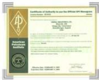
API 6D Certificate