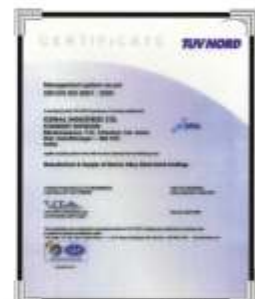
ISO Foundry Division