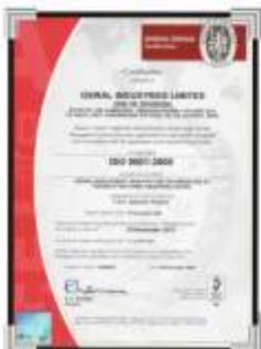
ISO 9001-2000 Certificate