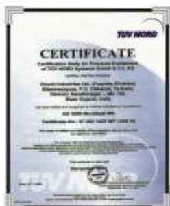
CE-PED Foundry Division