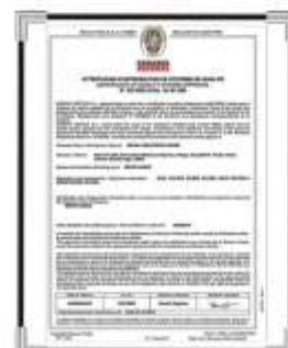
CE - PED